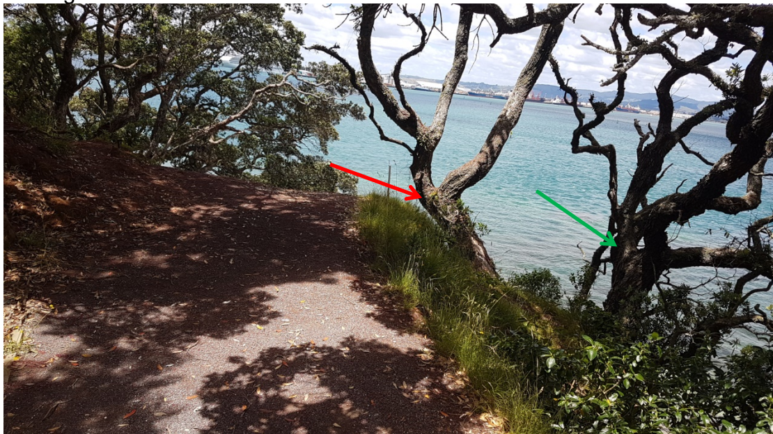
Photo 2 Tree to be removed (red arrow) and tree to be retained and reduced (green arrow)