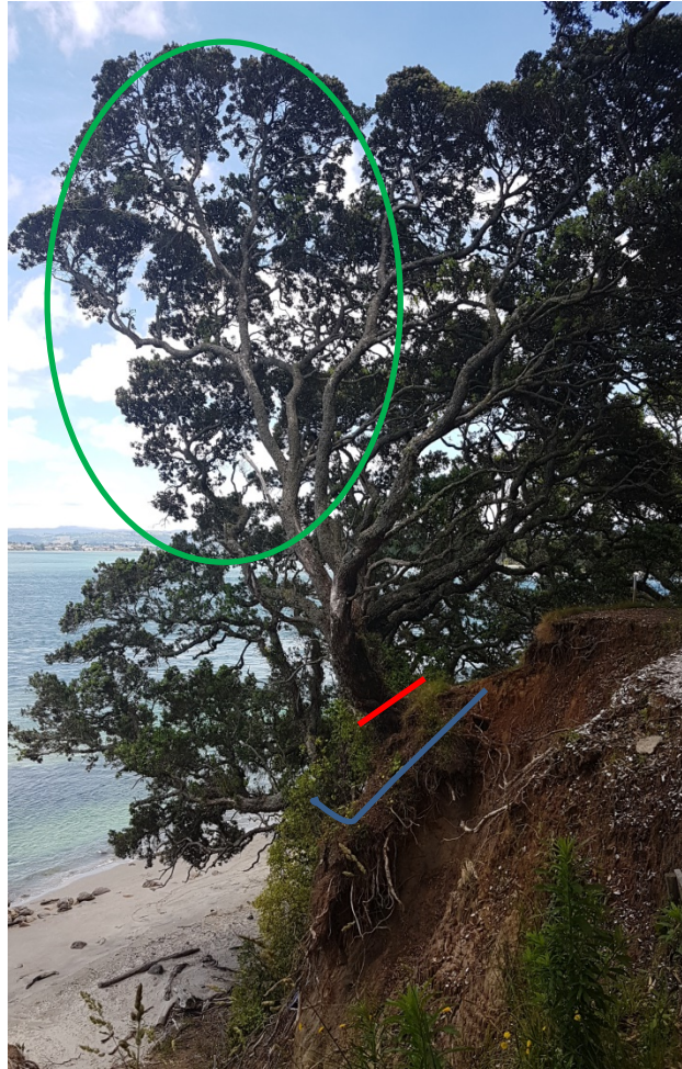
Photo 1 showing the tree to be removed (red line) and the approximate root ball area to be trimmed (blue line). The tree directly behind the tree to be removed (tree in green circle) will be retained but reduced to reduce the loading on the bank.